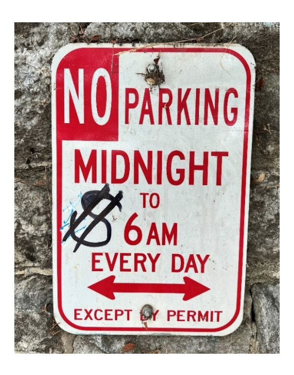
Fig 3. Depicts signage enforcing parking policies in Downtown Santa Cruz, CA.

One participant, Joanne, explained, 'Invention is bred of necessity. And when we're pushed out of one place, we're going to get creative and figure out where we can be and how we can support each other.' Through trial and error, vehicle residents spend every day dodging temporal parking policies while navigating and living in public spaces within the confines of their personally owned vehicle. This process led to vehicle residents' congregating at specific locations during different times of the day and these locations morphed into information grounds. The following three sections describe the environments where information grounds arose due to legal, punitive pushes.